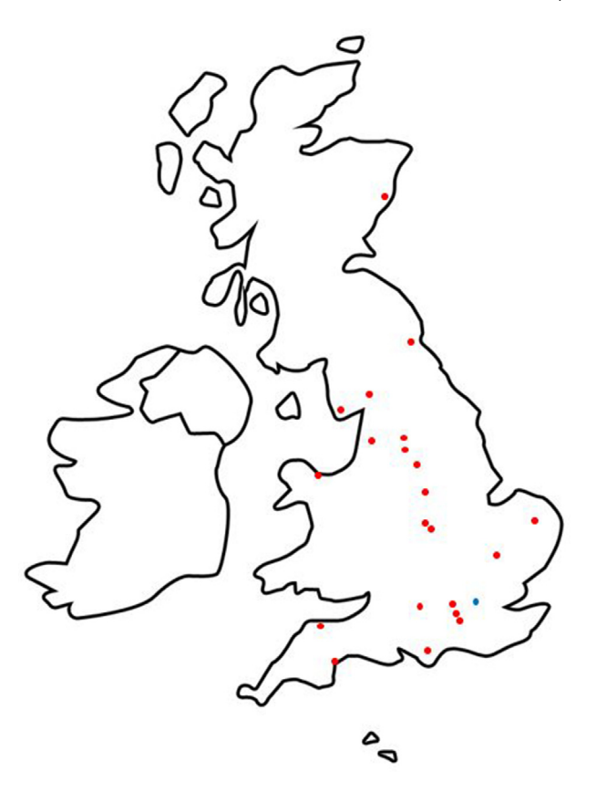
Figure 1 Map of the UK with red pins to mark the site of centres from which data were submitted. A blue pin denotes three independent centres within Greater London that submitted data. There is a notable spread throughout the UK including centres in Wales and Scotland and across England.

E. Robinson et al. / Clinical Radiology xxx (xxxx) xxx